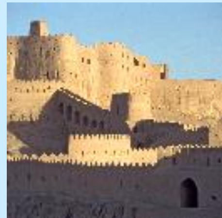
60th Anniversary of Iranian Natcom 1948-2008